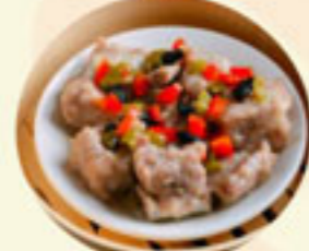
8. Steamed Spareribs 6.95