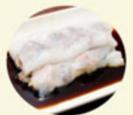
20. BBQ Pork Rice Noodle 7.95