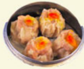
2. Shumai(4) 5.95