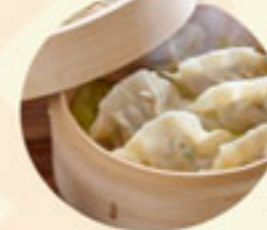
9. Steamed Dumpling (4) 5.50