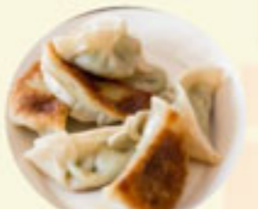
17. Pot Stickers (4) 5.50