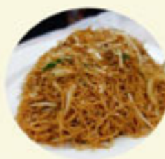
22. Soy Sauce Noodle 7.95