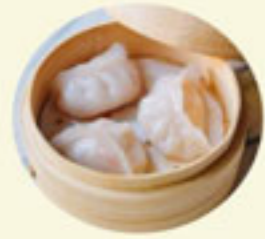
1. Har Gow(4) 5.95

Though dim sum can be found in many forms and in all regions of China, the cuisine is most closely associated with the teahouse culture of Hong Kong and Guangdong (Cantonese) Province.