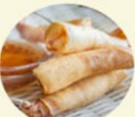
16. Shrimp Egg Rolls (3) 7.99