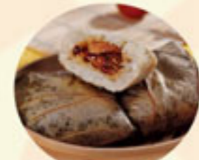
11. Sticky Rice in Lotus Leaf (3) 7.50