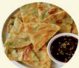
13. Scallion Pancake 7.50