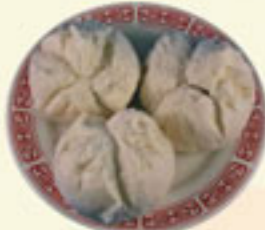
7. Steamed Chicken Buns (3) 5.95