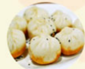
14. Pan Fried Pork Dumpling (4) 5.95