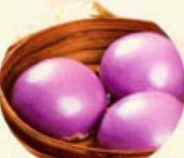
10. Steamed Taro Buns (4) 5.95