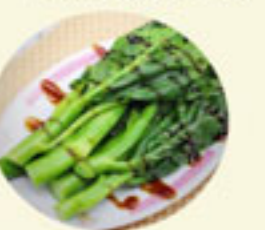
19. Chinese Broccoli w/Oyster Sauce 7.95