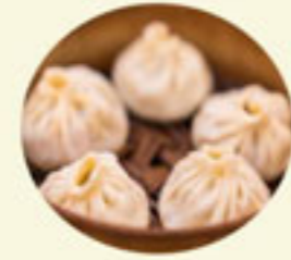
3. Shanghai Soup Dumplings(4) 6.95