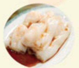
21. Shrimp Rice Noodle 7.95