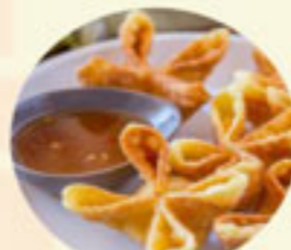
18. Crab Puffs (4) 4.95