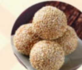
12. Sesame Balls (5) 5.50