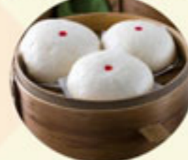
6. Custard Buns(4) 5.95