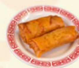
15. Spring Roll (3) 4.95