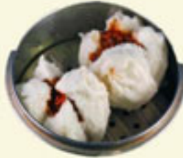
4. BBQ Pork Buns (3) 5.95