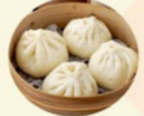
5. Shanghai Meat Buns (3) 6.95